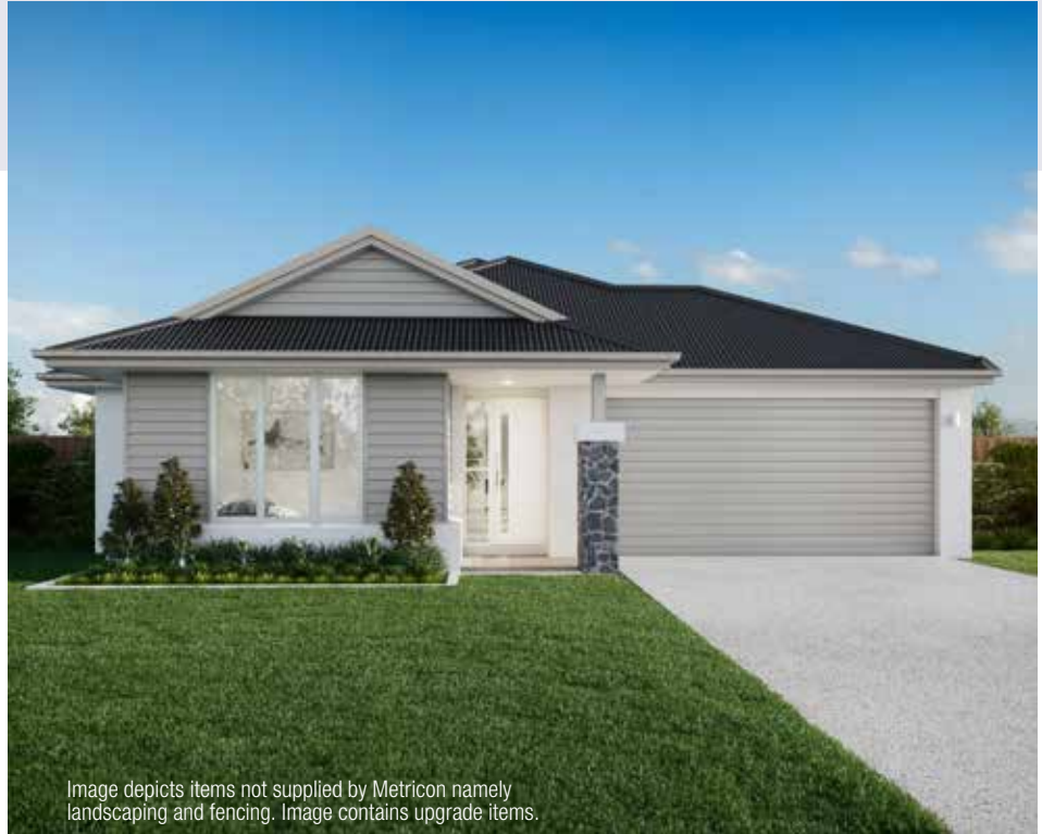
Image depicts items not supplied by Metricon namely landscaping and fencing. Image contains upgrade items.

Last but by no means least, the moment you experience the warmth and professionalism of our staff and the quality of our service and homes, you will immediately appreciate why we say “Not just any home, a Metricon home, from Australia’s No 1.”